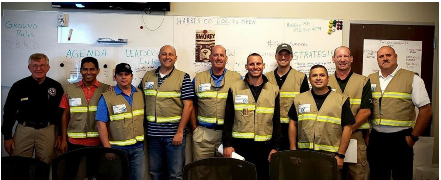
Webster O-305 (Team 4) July 2019

TFS Instructors: 13 (Taught 48% of classes) TFS Seasonal/Retired Instructors: 3 (28%) Contract Instructors: 2 (8%) RIMT Program Instructors: 6 (16%) TOTAL Instructors: 24 (100%)