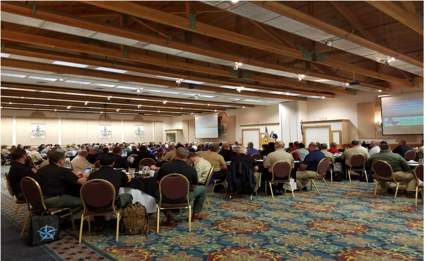
Annual Marty Martine AHIMT Training Conference